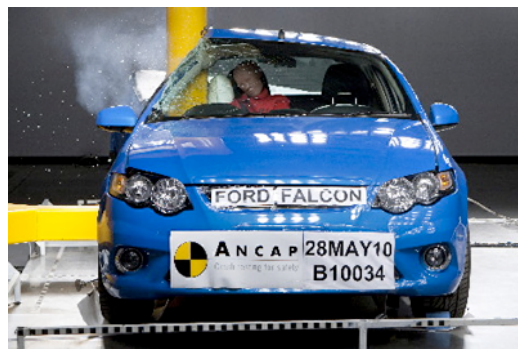
Side pole crash test at 29km/h