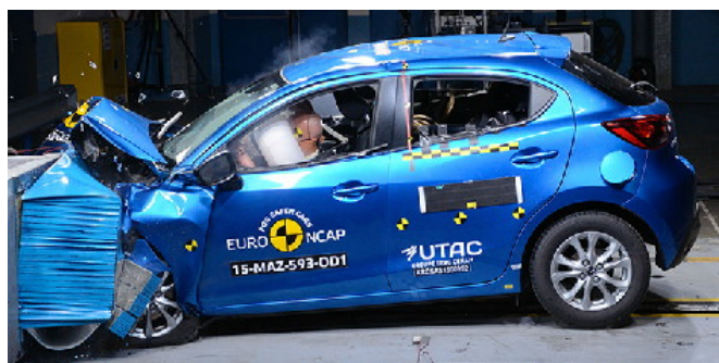
Frontal offset test at 64km/h (Euro NCAP)