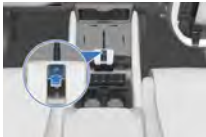
Shift into Park