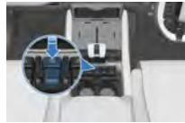
Turn off the ignition