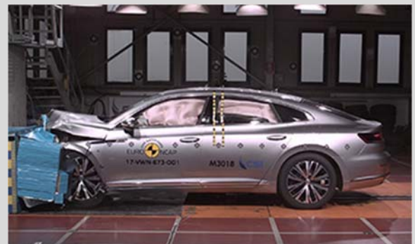
Frontal offset test at 64km/h