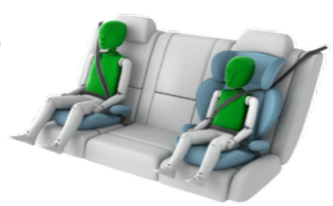
6 YEAR OLD