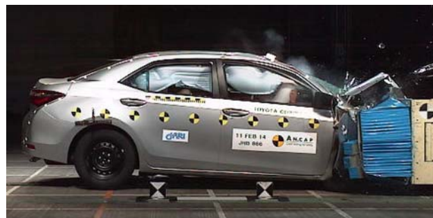
Frontal offset test at 64 km/h