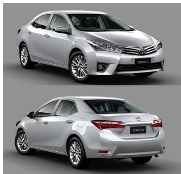
Toyota Corolla sedan