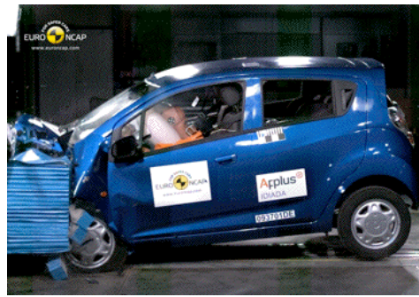
Offset crash test at 64km/h (note the rear door has a concealed door handle)