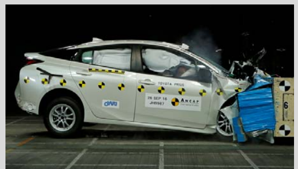
Frontal offset test at 64km/h