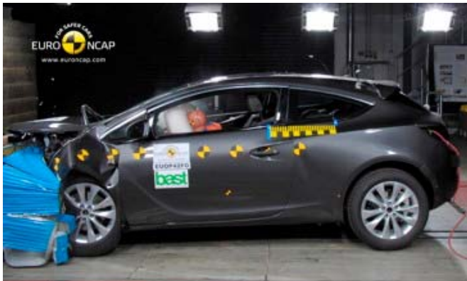
Frontal offset test at 64km/h (Euro NCAP)