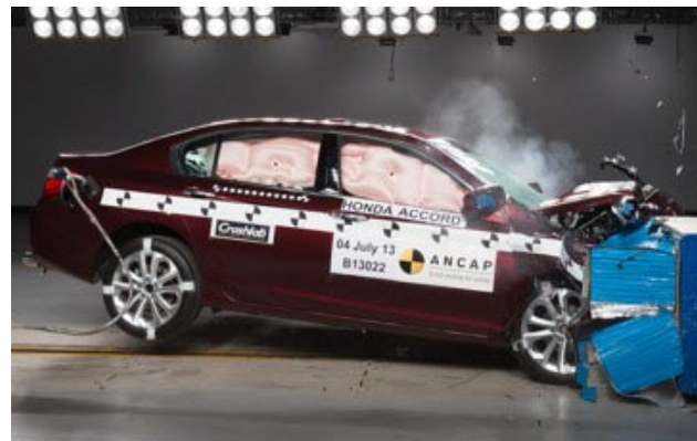
Frontal offset test at 64 km/h