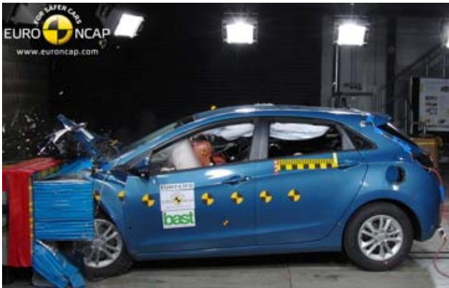
Frontal offset test at 64km/h (Euro NCAP)