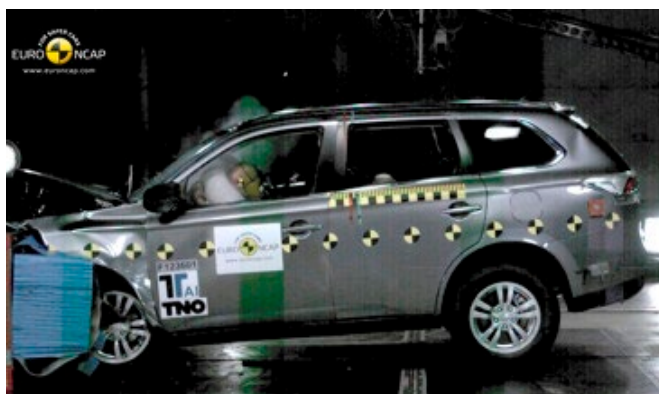
Frontal offset test at 64km/h