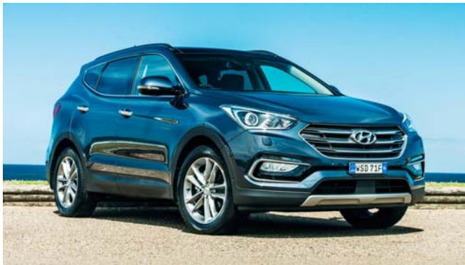
Hyundai Santa Fe