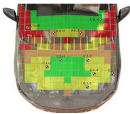
Child and adult head impact