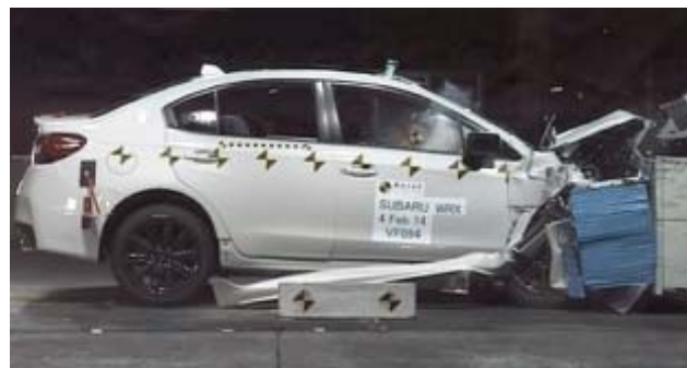
Frontal offset test at 64 km/h