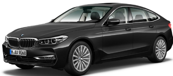
BMW 6 Series GT