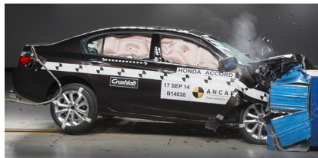
Frontal offset test at 64 km/h