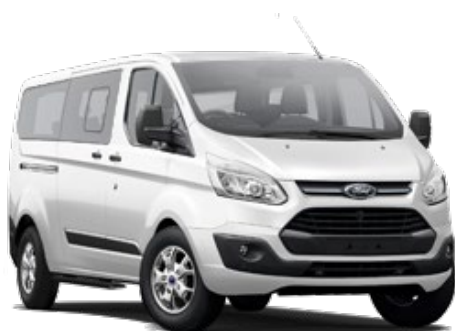
Ford Tourneo Custom