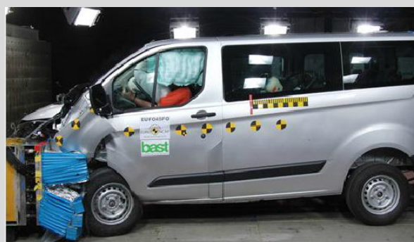
Frontal offset test at 56km/h (Ford Transit Custom)