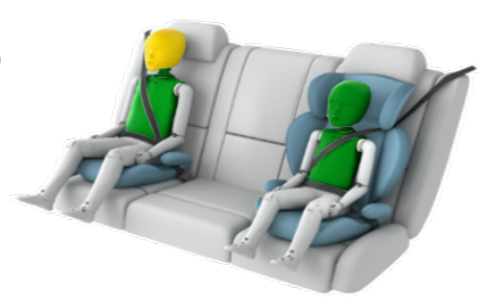
6 YEAR OLD