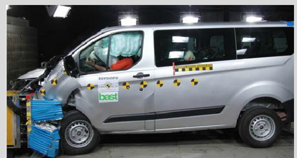
Frontal offset test at 56km/h