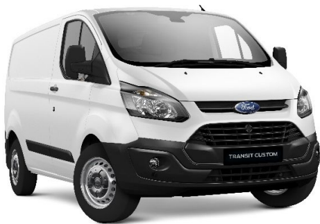
Ford Transit Custom