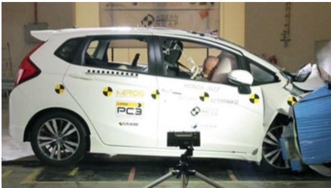
Frontal offset test at 64km/h (ASEAN NCAP)