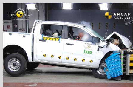
Frontal offset test at 64km/h