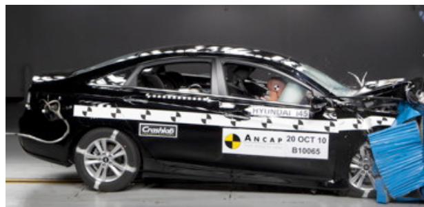
Offset crash test at 64km/h