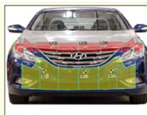
Adult leg impact (upper and full legforms)