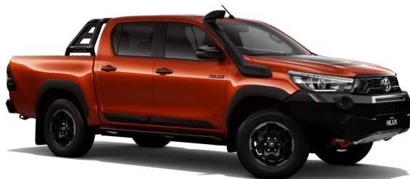
TOYOTA HILUX RUGGED X