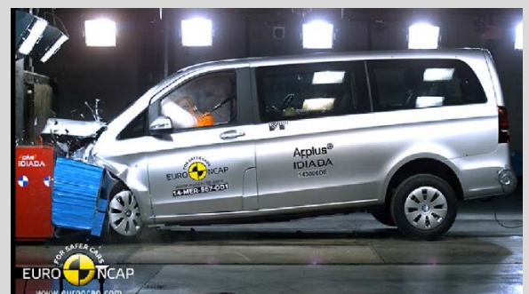
Frontal offset test at 56km/h (Mercedes-Benz V-Class)