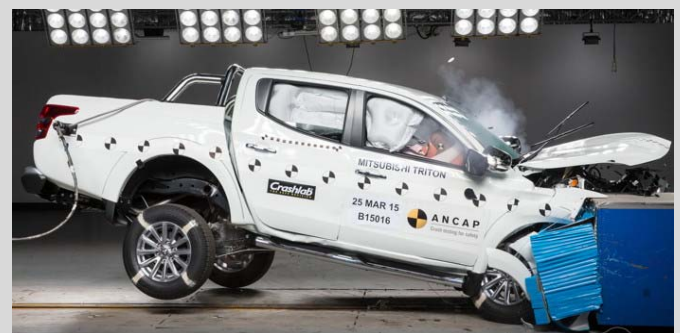
Mitsubishi Triton Frontal offset test at 64km/h