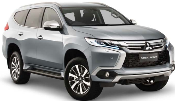
Mitsubishi Pajero Sport