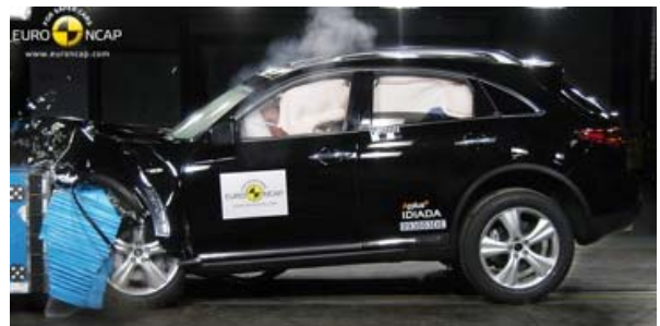
Offset crash test at 64km/h (Euro NCAP)