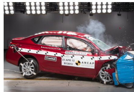
Frontal offset test at 64 km/h (sedan tested by ANCAP)

ANCAP conducted crash tests of the Pulsar sedan and was provided with evidence that the Pulsar hatch has equivalent occupant and pedestrian protection.