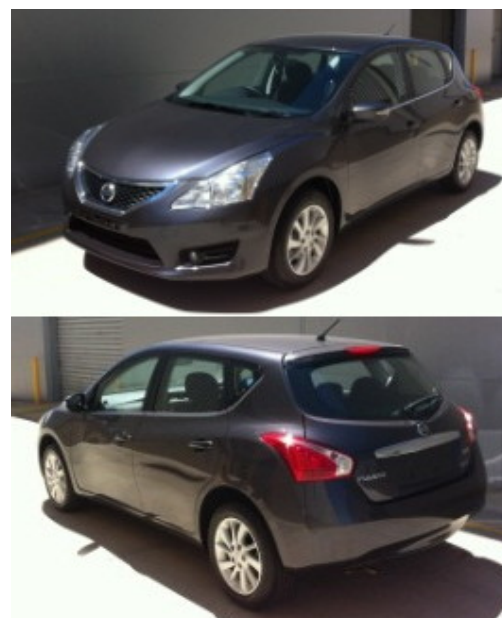
Nissan Pulsar hatch