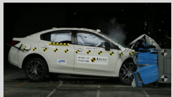
Frontal offset test at 64km/h (Subaru Impreza)