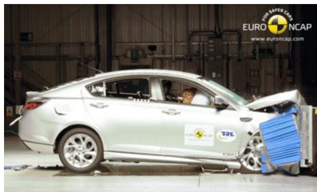
Frontal offset test at 64 km/h

Note: A right-hand-drive European model was tested by Euro NCAP.