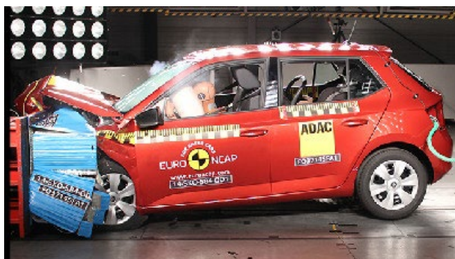
Frontal offset test at 64km/h (Euro NCAP)