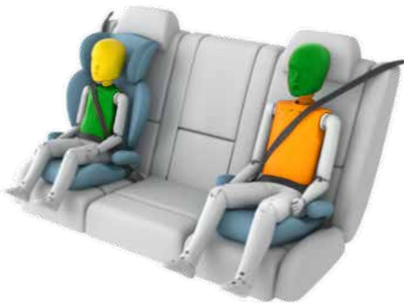
6 YEAR OLD