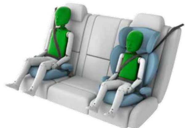
10 YEAR OLD