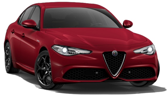
ALFA ROMEO GIULIA VELOCE