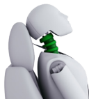
Driver / Front Passenger