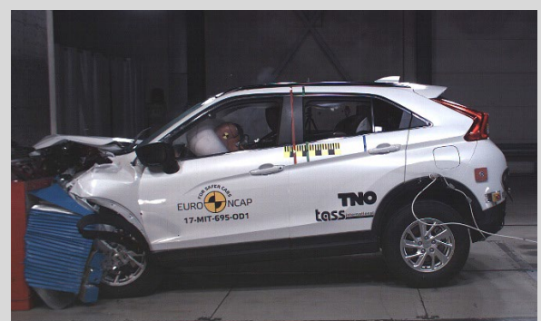
Frontal offset test at 64km/h