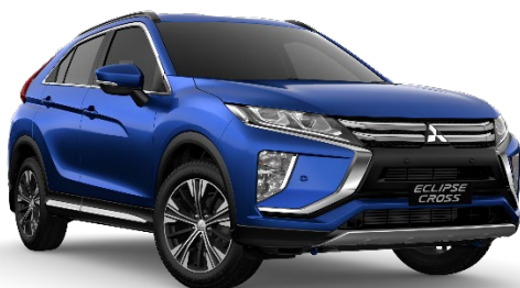
Mitsubishi Eclipse Cross