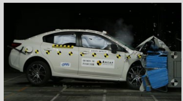
Frontal offset test at 64km/h (Subaru Impreza)