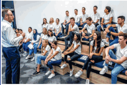
School captains from 26 different schools came together for a photo shoot at the Leader office.

To capture the fantastic picture on the front of this