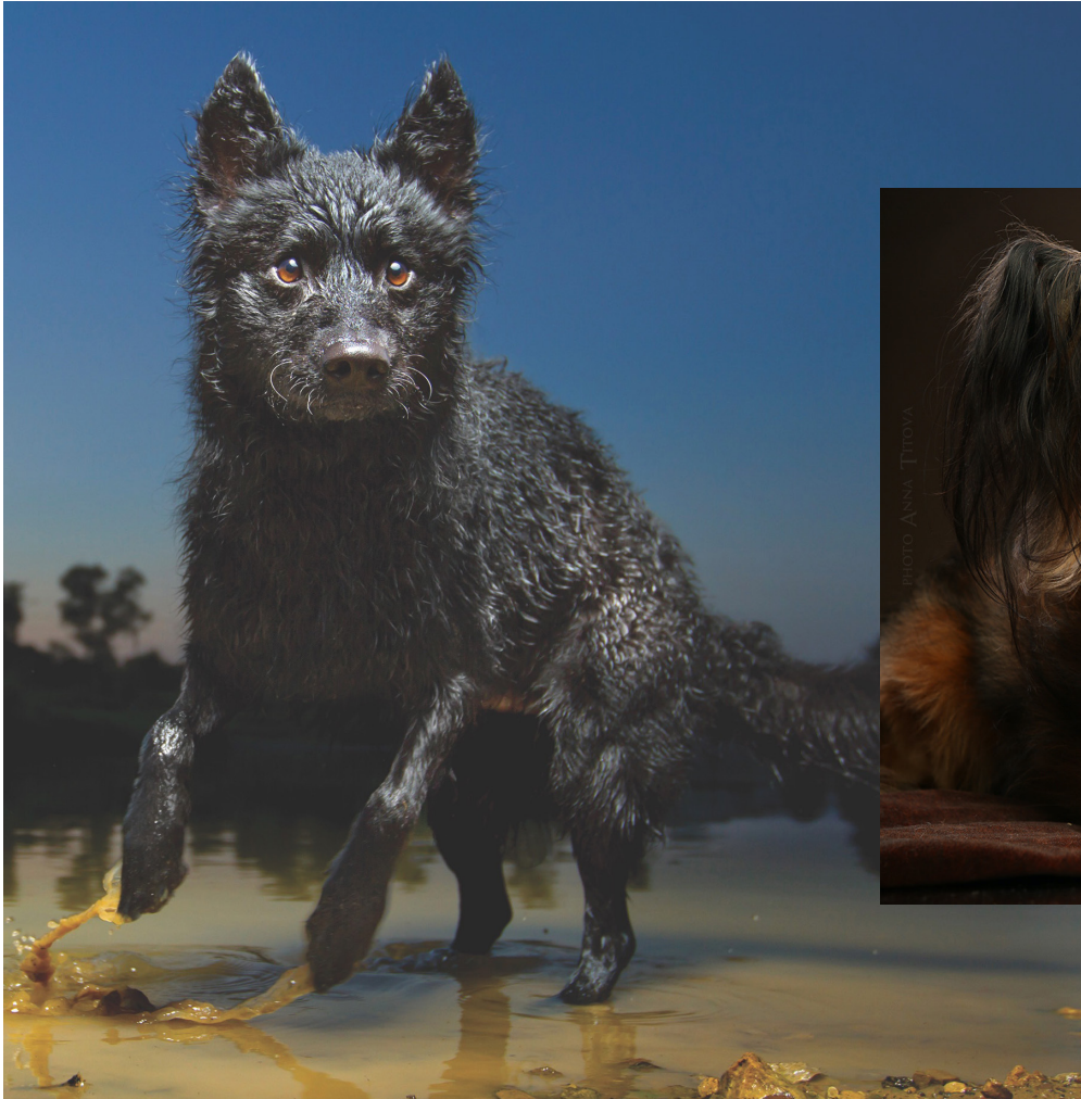
Mudi/Holly Hildreth, AKC Publications photo contest