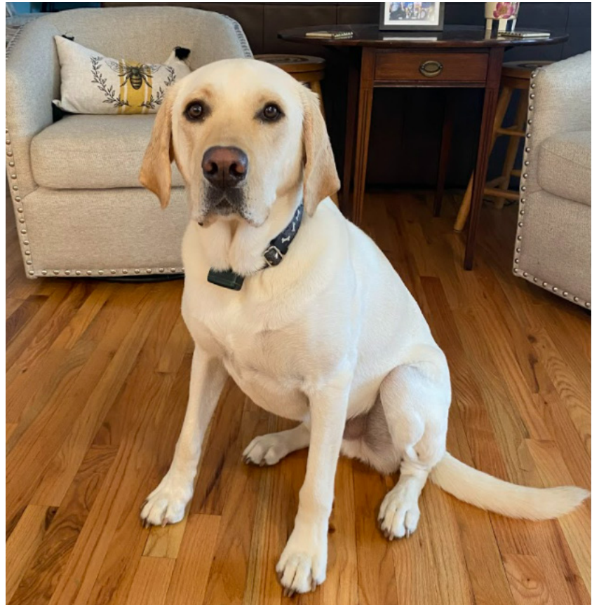
Henry

Congressman John Katko grew up with dogs. One of his favorite childhood memories is a welcomed bark at his front door, after his English Springer Spaniel, Snooper disappeared. It was 10 o' clock pm , and Snooper had been missing for over a day. After wandering off his family's property, Snooper had been found by the local animal control and taken to the pound. The Congressman, just a boy at the time, and his sisters were devastated. There was never any real explanation for Snoopers mysterious arrival back at the front door that night, but Katko distinctly remembers having seen paw prints in sister's boyfriend's truck. Although the boyfriend never admitted it, the evidence was pretty incriminating that Snooper had received some help springing out of the pound!