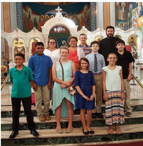
Confirmation Class at Holy Trinity Greek Orthodox Church in Dallas, Texas.