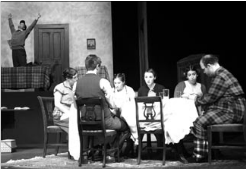
Brighton Beach Memoirs was the Theatre Arts Department's Fall 2005 production.

**THA 3730 may be taken a maximum of two times for program credit.