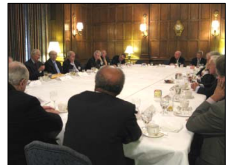
CAA members participate in the Roundtable