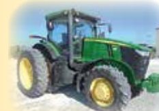
2012 7215R C/A MFD CommandQuad w/Duals 2087 Hrs.