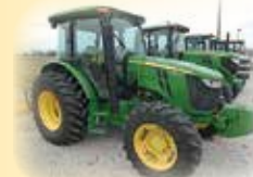
2016 5115M C/A MFD P.Reverse Loader Ready 665 Hrs.