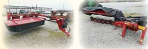
2014 CaselH DC102 Roller MoCo 2014 Vicon 122 8' 3pt Disc Mower

2014 NH RB450 Utility Baler New Miller Pro 7914 Hay Merger 2015 NH RB560 Net Wrap Baler 3500 Bales 2014 NH BR7060 Baler 2007 NH BR7090 Net Wrap Baler NH RB450 Baler JD 547 Baler (2) JD 530 Baler's Vermeer 605 Super M Baler M&W 5506 Baler M&W 4500 Baler Farmhand Bale Accumulator 2015 Canag Proline Bale Wrapper H&S CR10 10-Wheel Rake Frontier WR2010E 10-Wheel Rake 2015 JD 835 Flail MoCo