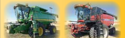
2008 JD 9670STS 4WD CM Combine 1904/1346 Hrs. CaseIH AFX8010 4WD FT. Chopper Combine 2500/3200 Hrs.

2004 JD 9660STS 4WD CM Combine 2764/4103 Hrs. 2004 JD 9560 2WD CM Combine 2777/1825 Hrs. JD 9570 STS 2WD CM Combine 1994/1351 Hrs. 1995 JD 9600 2WD Combine 6266 Hrs. JD 7720 Titan II 4WD Combine Gleaner F2 D Combine 2014 MacDon FD750 Flex Draper 2013 MF 9250 40' Flex Draper 2013 MF 9250-35 35' Flex Draper 2005 CaselH 2062 30' Flex Draper 2010 Gleaner 8200-35R 35' Flex Table 2013 JD 635F CM Flex Head 2012 JD 630F Flex Head 2006 JD 625F CM Flex Head 2003 JD 925F CM Flex Head 1991 JD 915F Flex Head JD 4-Belt CM P.U. Head JD 212 P.U. Head JD 100 4-Belt P.U. Head 2010 CaselH 2020 20' Flex Head 2004 CaselH 1020 25' Flex Head 2009 CaselH 2020 Flex Head JD 693 Cornhead JD 643LL Cornhead (2) JD 643 Cornheads JD 608C CM Cornhead 2011 JD 606C Cornhead