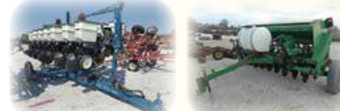
Kinze 3500 8/15 No-Till Planter Great Plains 1205NT 12' Drill w/Liquid Fertilizer 110 Gal. & Grass Seeder

2009 JD 1790 12/23 CCS No-Till Planter 2003 JD 1790 16/32 CCS No-Till Planter CaselH 800 6-Row Planter Pull Type 1999 JD 1560 15' Drill 2pt JD 8300 Drill w/Grass JD Van Brunt Drill CaselH 5300 Drill CaselH 5100 Soybean Drill IHC 510 Grain Drill Great Plains 15' No-Till Drill