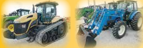
2003 Caterpillar Challenger MT755 C/A 3pt. & PTO 6981 Hrs. LS P7030 C/A MFD w/LS L7100 Loader 333 Hrs.

2007 MF 2605 Rollbar MFD w/Loader 890 Hrs. MF 2605 Rollbar 2WD 1432 Hrs. 2005 MF 1526 Rollbar MFD Hydro w/MF 1520L Loader 1693 Hrs. MF 283 Rollbar 2WD w/MF 1060 Loader MF 255 D 2WD 1997 MF 6170 C/A MFD 2800 Hrs. Agco ST52A C/A MFD 2745 Hrs. Agco 8675 C/A MFD w/Loader 2600 Hrs. AC 185 D w/Cab AC 175 D w/Loader AC D-17 D w/Loader