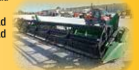
2011 JD 625F Flex Head

2004 JD 9660STS 4WD CM Combine 2764/4103 Hrs. 2004 JD 9560 2WD CM Combine 2777/1825 Hrs. JD 9570 STS 2WD CM Combine 1994/1351 Hrs. 1995 JD 9600 2WD Combine 6266 Hrs. JD 7720 Titan II 4WD Combine Gleaner F2 D Combine 2014 MacDon FD750 Flex Draper 2013 MF 9250 40' Flex Draper 2013 MF 9250-35 35' Flex Draper 2005 CaselH 2062 30' Flex Draper 2010 Gleaner 8200-35R 35' Flex Table 2013 JD 635F CM Flex Head 2012 JD 630F Flex Head 2006 JD 625F CM Flex Head 2003 JD 925F CM Flex Head 1991 JD 915F Flex Head JD 4-Belt CM P.U. Head JD 212 P.U. Head JD 100 4-Belt P.U. Head 2010 CaselH 2020 20' Flex Head 2004 CaselH 1020 25' Flex Head 2009 CaselH 2020 Flex Head JD 693 Cornhead JD 643LL Cornhead (2) JD 643 Cornheads JD 608C CM Cornhead 2011 JD 606C Cornhead