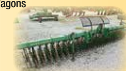
JD 400 15' Rotary Hoe

JD 15A Flail Chopper New Idea 2-Row Picker Landpride 5' 3pt. Tiller Dunbar Grain Vac 8' Pasture Punch PT Danuser Post Driver WE-MAC 1000 Gal. Fuel Tank Kilbros 20' Header Trailer Unverferth HT36 Header Trailer Unverferth HT30 Header Trailer Black 440 Header Trailer Black 425 Header Trailer Befont Triple Axle Header Trailer Horst HT35 Header Trailer