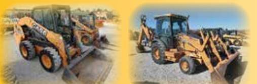
2012 Case SV250 C/A Skid Steer 1001 Hrs. 2007 Case 580SM C/A MFD Extendahoe 6259 Hrs.

2001 Case 1825B Skid Steer 1909 Hrs. Case 85XT Skid Steer 2831 Hrs. NH LS180 Skid Steer 922 Hrs. NH LS180 Skid Steer 1127 Hrs. Gehl V270 Skid Steer 2600 Hrs. Kubota SVL90 C/A Skid Steer 1300 Hrs. 2007 Genie GTH842 Telescopic Forklift 9445 Hrs. Case 588H ROPS 4X4 Forklift 1892 Hrs. Caterpillar VC60D Forklift Real Forklift Caterpillar 416D C/A 4X4 Extendahoe 3842 Hrs. 1998 Cast 570LXT w/Bucket & Forks JD 2350 w/Mid Mount Sickle Mower IH 2400B w/Loader 1998 Lull 644B Telehandler Stout XHD 84-6 Brush Grapple Shopmade Skid Steer 5' Brush Cutter Tuff Ox Skid Steer Tree Puller DynaPac LR50 Roller Sheepsfoot Duz-All 8' Grader Blade Sand Side Shooter Easyman Skid Steer Tree Shear Lowe Hyd Auer 750 w/12" Skid Steer Quick Attach New MS WT Pallet Forks New Stout XHD84-6 Brush Grapple New Stout HD72-8 Brush Grapple New Stout HD72-4 Brush Grapple New Stout 66-9 Brush Grapple New Stout HD72-3 Rock Bucket w/Brush Grapple New Stout 84" & 72" Skid Steer Buckets New Stout Tree & Post Puller New Stout Grapple Fork New Skid Steer Plates Set Skid Steer Tracks 120R Grader Blade New 12' & 10' & 8' & 7' Pull Type Box Blades Anderson Rock Picker (2) Snow Blades 1996 Broce CMH20 Street Broom 819 Hrs. Murray Hyd 100' Broom Attachment Ingersoll-Rand Light Tower