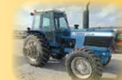
Ford TW30 C/A MFD w/Duals 3672 Hrs.