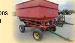
Kilbros 350 Gravity Wagon