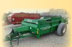
Hydra Ram Top Beater Hyd. Push

2018 Kuhn Knight SL118 2015 Kuhn 8124 Slinger 2013 Kuhn Knight 8141 H&S 1800 Hyd. Gate Meyers V-Max 3245 Meyers 125 w/Gate Meyer 3954 (2) Meyer Slurry JD 450 JD 40 IHC 530 New Idea