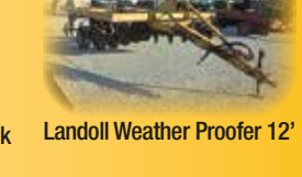
Landoll Weather Proofer 12'

JD 15A Flail Chopper New Idea 2-Row Picker Landpride 5' 3pt. Tiller Dunbar Grain Vac 8' Pasture Punch PT Danuser Post Driver WE-MAC 1000 Gal. Fuel Tank Kilbros 20' Header Trailer Unverferth HT36 Header Trailer Unverferth HT30 Header Trailer Black 440 Header Trailer Black 425 Header Trailer Befont Triple Axle Header Trailer Horst HT35 Header Trailer