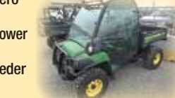
2012 JD 825i XUV Gator 1563 Hrs.

2008 JD 4830 C/A Sprayer Stainless 90' Booms 2013 JD 825i Gator 802 Hrs. 2013 Polaris ACE 570 UTV 313 Miles Ranger 900XP 4X4 1299 Hrs. Massimo Militia 1000 4X4 UTV 197 Hrs. 2015 Cub Cadet ZFLZ48 Zero Turn Mower Hustler Fastrak Zero Turn Mower Artic Cat 4-Wheeler Brillion SLP-642 6' 3pt Seeder Brillion SS12 12' Seeder Brillion SS10 10' Seeder (2) Brillion 10' Seeders Unverferth 7250 Grain Cart Kilbros 1400 Grain Cart Brent 672 Grain Cart (2) DMI E280 Gravity Wagons Kilbros 390 Gravity Wagon J&M 525 Gravity Wagon Bairds SMP5415 Disc Mower Caddy Double RR Line Auger Wagon w/Scales (2) Schuler HF255 Feed Wagons (2) Kelly Ryan Feed Wagons Clay 2250 Honey Wagon Heider Auger Box Aerway 20' Aerator Steiger 2209 Mulch Tiller JD 300 Picker w/3RN Head Blu Jet 12-Shank AA Applicator Ag Systems 6000 11-Shank Liquid Fertilizer Applicator Krause 4428 Cultipacker Kewanee 15' Cultipacker Brillion 15' Mulcher JD 560 15' Mulch Master McFarlane Drag Harrow Hardi PT 500 Gallon Sprayer