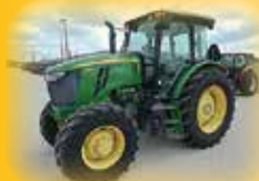
2016 6135E C/A MFD P.Reverse 2348 Hrs.