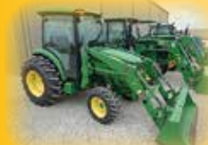
2014 4052R C/A MFD Hydro w/JD H180 Loader 611 Hrs.