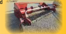
CaseIH 1015 Pick Up Head