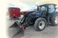
NH T6050 C/A MFD Powershift w/ Westendorf 550 Loader 2920 Hrs.