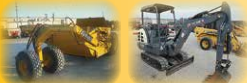
Ashland I-950 Hyd Eject Scraper 2015 Terex TC29 ROPS Mini Excavator 269 Hrs.

2013 Leon 1000A Hyd Eject Scraper (2) Icon CEM17B Scraper JD 750C LGP ROPS 6-Way Blade 2002 JD 352X ROPS Mini Excavator w/Hyd Thumb 2281 Hrs. 2013 Takeuchi TL12 C/A Track Skid Steer 880 Hrs. Bobcat T770 C/A Hi-Flow Forestry Package Track Skid Steer 1200 Hrs. 2013 Bobcat S770 C/A 2-Spd Skid Steer 596 Hrs. 2013 Bobcat S650 Skid Steer 1734 Hrs. 2011 Bobcat S650 C/A Skid Steer 412 Hrs. 2011 Bobcat T110 w/Cab Track Skid Steer 4687 Hrs. 1999 Bobcat 863 Skid Steer 3117 Hrs. Bobcat 773 Skid Steer 2013 JD 323E Track Skid Steer 1211 Hrs. JD 323E C/A Track Skid Steer 2009 JD CT332 C/A 2-Spd Hi-Flow Track Skid Steer 1768 Hrs. JD CT322 C/A Track Skid Steer 2607 Hrs. (2) JD 270 Skid Steers 2006 320 C/A Skid Steer 1198 Hrs. JD 317 Skid Steer JD 6675 Skid Steer 2015 Caterpillar 259D Skid Steer 1418 Hrs. 2011 Caterpillar 277C C/A 2-Spd Skid Steer 3562 Hrs. 2010 Caterpillar 252B C/A Skid Steer 1738 Hrs. Caterpillar 289B Track Skid Steer 1502 Hrs. Caterpillar 257B2 Track Skid Steer 3728 Hrs. Cat 289D C/A Track Skid Steer 2006 Case 445CT Track Skid Steer 1200 Hrs. 2006 Case 430 C/A Skid Steer 2430 Hrs. 2006 Case 450CT Track Skid Steer Case 450 III Skid Steer 1793 Hrs.