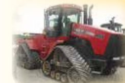
2008 CaseIH Steiger 485 C/A Quad Trak w/PTO 3917 Hrs.