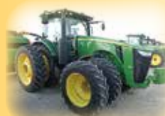
2012 8235R C/A MFD w/ ILS Powershift w/F&R Duals 1700 Hrs.