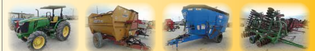
2013 JD 5100E Rollbar MFD P.Reverse 1301 Hrs. Knight 3375 Horizontal TMR Wagon Patx V620 Twin Screw Vertical TMRWagon w/Scale JD 25' Vertical Till

Ford 7610 II C/A MFD 1987 L3750 MFD w/Loader 2784 Hrs. JD 8300 Drill Gehl 65 Grinder JD 148 Loader Bushhog 2102 Post Hole Digger 3pt