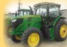
2016 6145R C/A MFD 20- Spd P.Quad 350 Hrs.