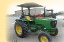
2013 5075E Rollbar 2WD 1157 Hrs.