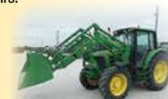
2008 6430 Premium C/A MFD P.Quad w/JD 673SL Loader 2450 Hrs.