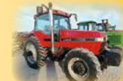
1996 CaseIH 8920 C/A MFD Powershift w/Duals 4996 Hrs.