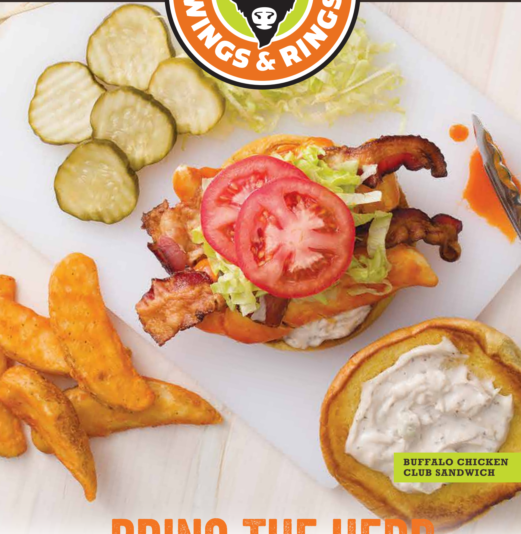
BUFFALO CHICKEN CLUB SANDWICH