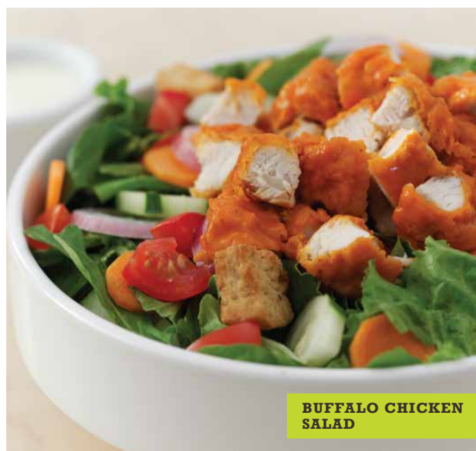
BUFFALO CHICKEN SALAD

Choose from BW&R Chili or Soup of the day, and Caesar or Garden salad. 7.99