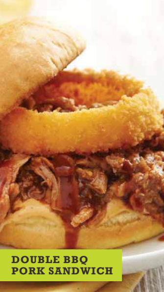
DOUBLE BBQ PORK SANDWICH