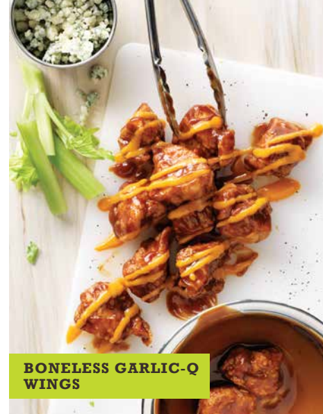
BONELESS GARLIC-Q WINGS