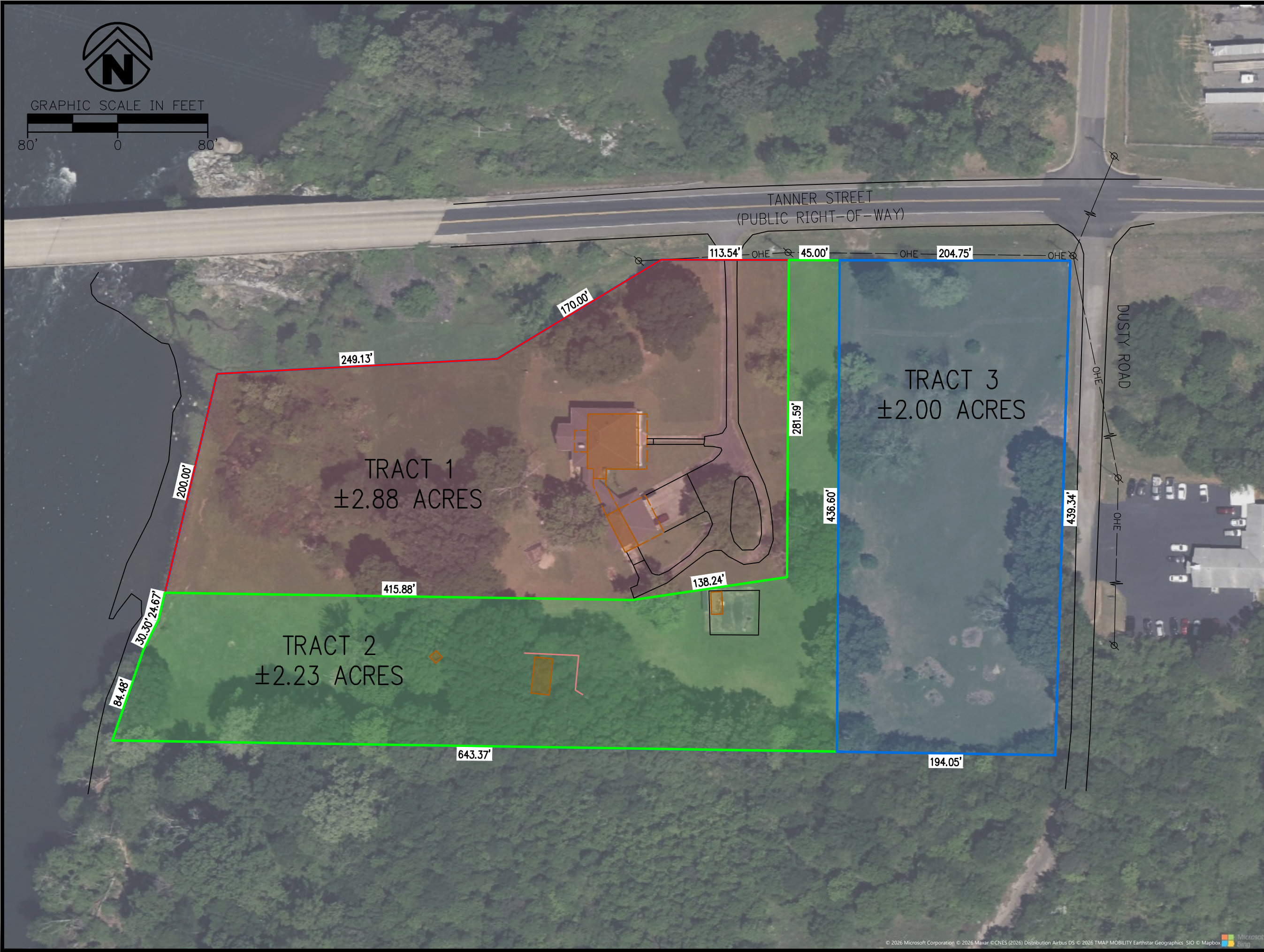
EXHIBIT PART OF NE1/4 NW1/4 SEC 16 - T04S - R 17W 1821 TANNER STREET