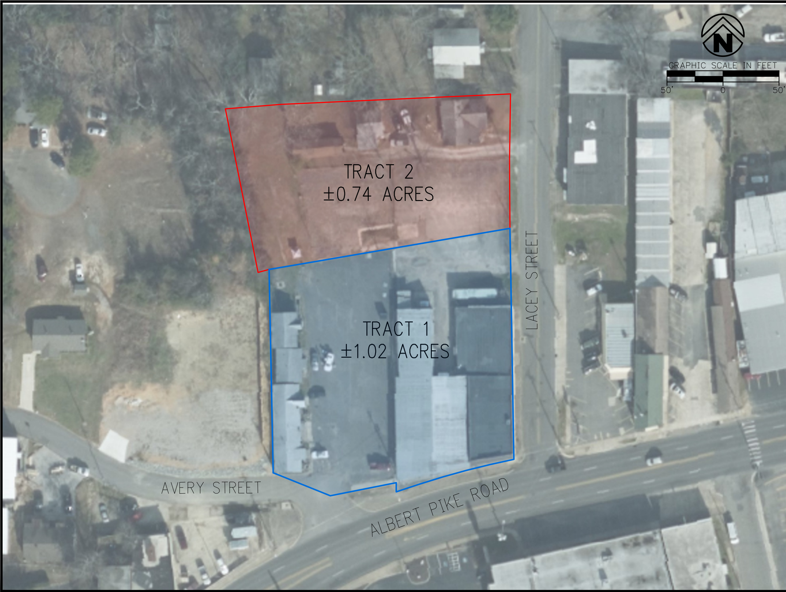
EXHIBIT PART OF THE SE 1/4 SE 1/4 OF SEC. 6, T3S, R19W PART S1/2 OF LOTS 1 AND 2, BLK. 3 WOODLAND ADDITION 606 ALBERT PIKE RD PREPARED FOR: WILSON AUCTIONEER HOT SPRINGS, GARLAND COUNTY ARKANSAS

DRAWING: G:\CONWAY BOUNDARY SURVEYS\CBSSV0721_WA PLAN B INVESTMENTS\CBSSV0721 PLAN B INVESTMENTS SOUTH.DWG LAYOUT: 11X17 LANDSCAPE - LAST SAVED: BF 1472_3/16/2026 3:30:34 PM LAST PLOTTED BY: BRANDON FOILES_3/17/2026 7:40:55 AM (PLOTTED BY: VALID ON HARD COPY ONLY)