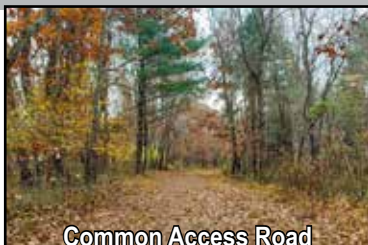
Common Access Road

BID LIVE OR ONLINE Can't attend the live auction? Bid online at bid.trfauctions.com