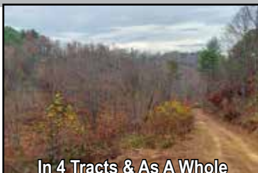
In 4 Tracts & As A Whole