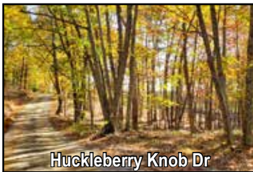
Huckleberry Knob Dr