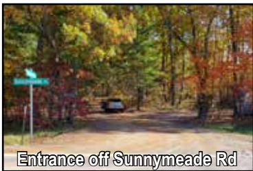
Entrance off Sunnymead Rd