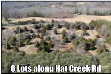
6 Lots along Hat Creek Rd