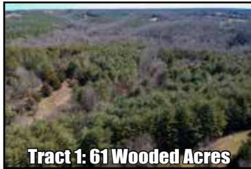
Tract 1: 61 Wooded Acres