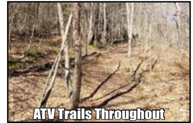
ATV Trails Throughout

AUCTION SITE: HAT CREEK GOLF COURSE • 437 GOLF COURSE RD, BROOKNEAL, VA