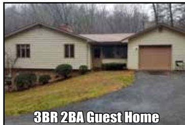
3BR 2BA Guest Home