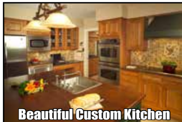
Beautiful Custom Kitchen