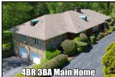
4BR 3BA Main Home

39 Acres, 2 Homes, Horse Facilities, Pond, Stream