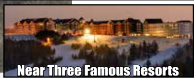
Near Three Famous Resorts

Coldwell Banker Commercial Read & Co., Realtors® 101 Annjo Ct, Forest, VA 24551 434-847-7741