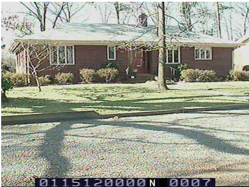
Last Photo Update 02/17/1997